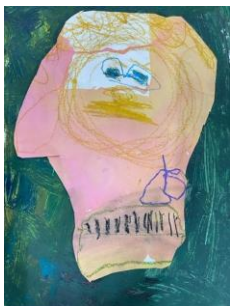
Nate P 2A