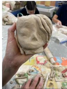
6S Clay Head